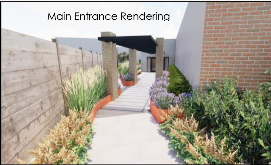
Main Entrance Rendering